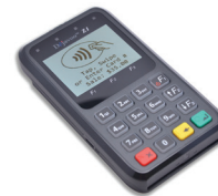
Any Dejavo terminal