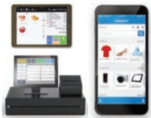
Any POS solution

Smart payment solutions can help increase profit. SPIn easily integrates with electronic cash registers, POS software, kiosks and more. Access your transaction reporting easily any place you can access the web using DeNovo Business Portal and DeNovo Mobile Application from your smart phone or tablet.