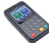
Any Dejavoo terminal