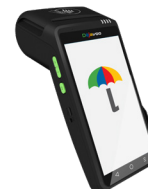
Any Dejavoo terminal