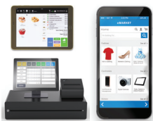
Any POS solution

Smart payment solutions can help increase profit. SPIn easily integrates with electronic cash registers, POS software, kiosks and more. Access your transaction reporting easily any place you can access the web using DeNovo Business Portal and DeNovo Mobile Application from your smart phone or tablet.